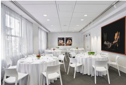
GALLERY FOUR 714 SQ FT