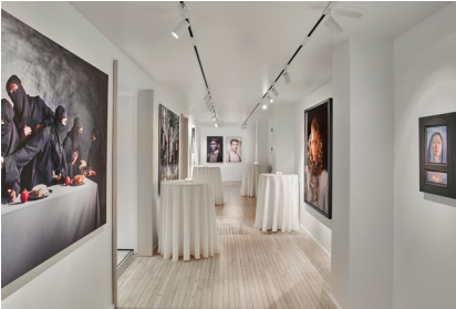
GALLERY CORRIDOR 1860 SQ FT + 932 SQ