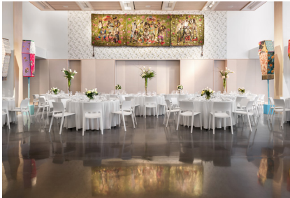
MAIN GALLERY + GALLERY ONE 1860 SQ FT + 932 SQ FT

Name your need – board retreats, executive meetings, cocktail gatherings, reception dinner, intimate weddings, charitable events, product launches, and more – and our on-site Events Team will oversee every detail of your customized event. Make your art-filled gathering the talk of the town with our unique amenities and add-ons.