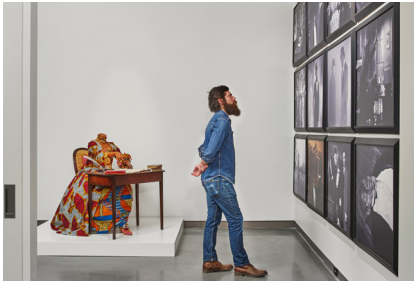
GALLERY FIVE 259 SQ FT