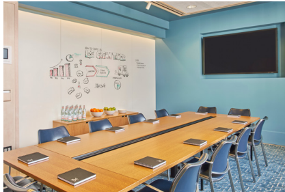
CONFERENCE ROOM 273 SQ FT