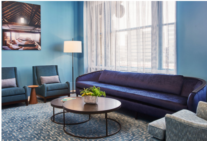
GALLERY TWO 252 SQ FT