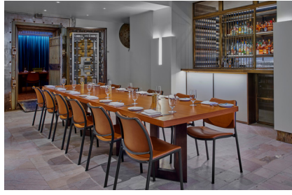
COMMUNAL TABLE SEATS 12