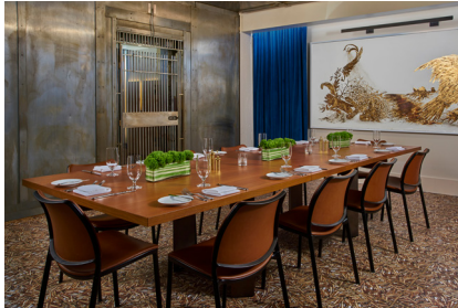
THE SAFE 304 SQ FT