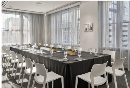
GALLERY THREE 406 SQ FT